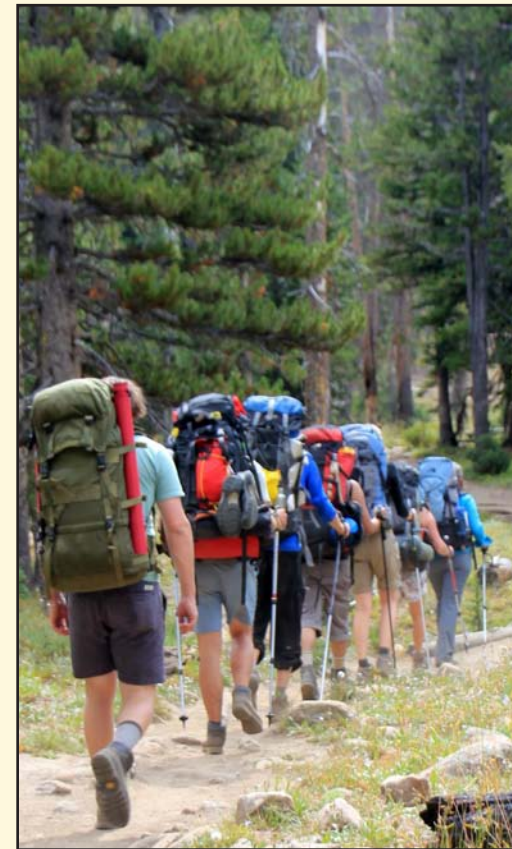
Wild Gift 2011 Class Trek